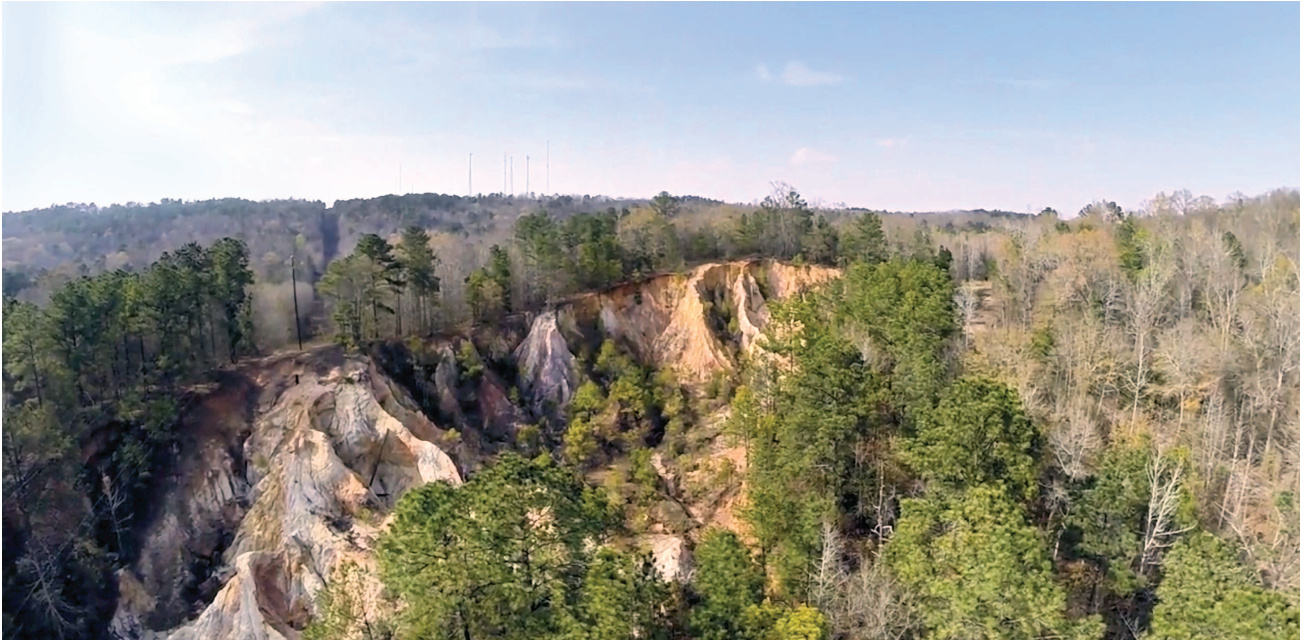
This unusual formation found near the center of the Wetumpka crater is know by local residents as "The Cliffs."