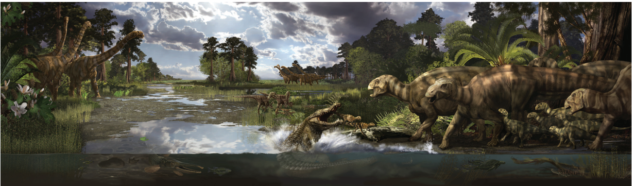
Cretaceous Landscape, Digital Painting printed on canvas by Karen Carr, 120" x 33.5"