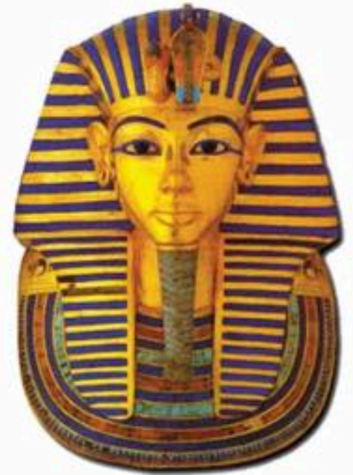
2017 Parade Theme Ancient Egypt*